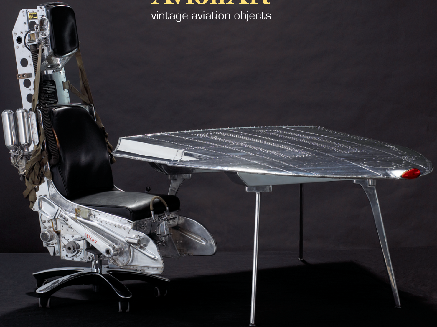
F-104 Lockheed Starfighter Ejection Seat (1964)